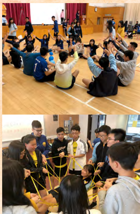
G10 – Senior Associate Camp (School Campus)