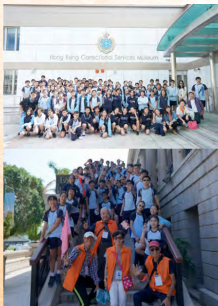
G8 – Liberal Arts Cultural Day (Stanley)