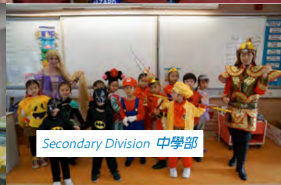
Secondary Division 中學部