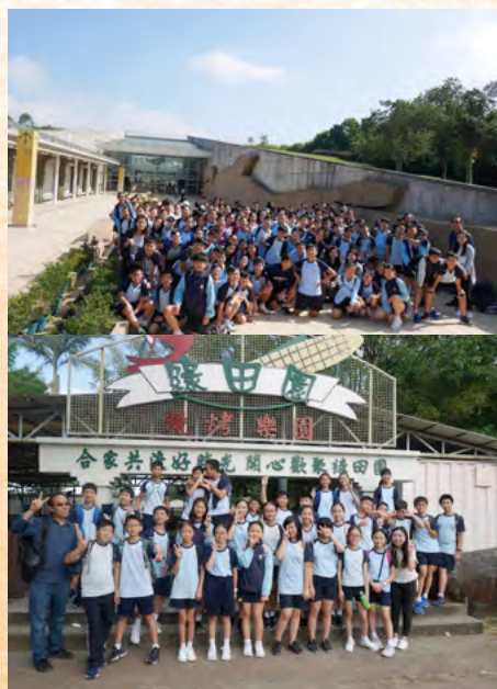
G7 – Exploring Hong Kong Wetland Ecosystem (Wetland Park & Greenfield Garden)