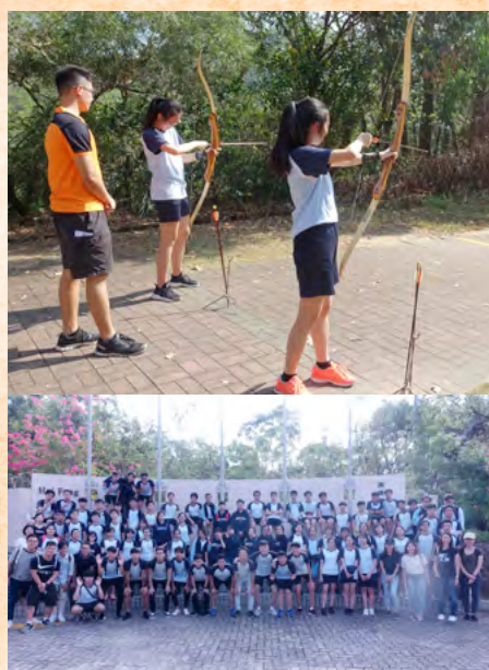
G11 – Outdoor Adventure Experience (Po Leung Kuk Jockey Club Tai Tong Holiday Camp)